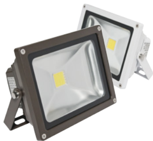
FL-201-45-DB (Dark Bronze) FL-201-45-WH (White) Panorama Pro 201 4500K / 20W / 1700Lm