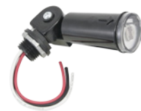
PC-120 (120V AC) PC-277 (208-277V AC) Dusk to dawn pencil photocell (requires C-201)