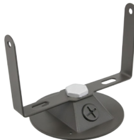
C-201-DB (Dark Bronze) C-201-WH (White) Canopy Mount for FL-201 *Includes 1/2" NPS for photocell